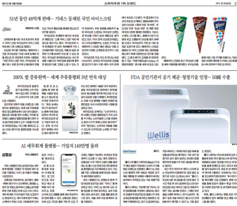
Article in the newspaper

*Original Article: https://www.chosun.com/special/special_section/2021/05/18/FH7WVGKRTNC63L6SELKPGPWUPM/